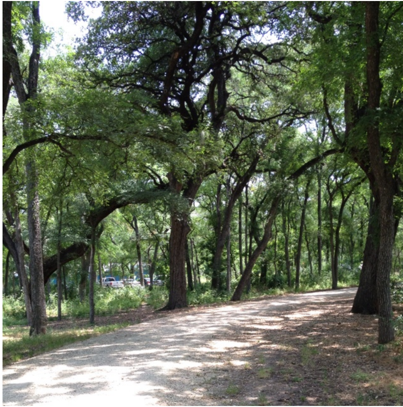
The Wilderness Grove and trails today.